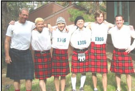
Wallace Tug-of-Warriors at Portland, OR