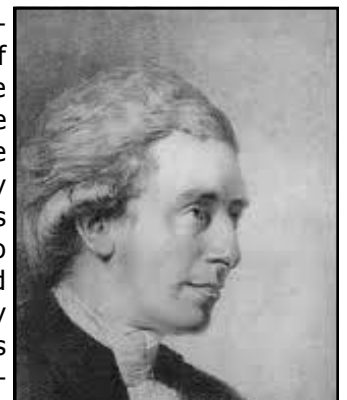
The 11th Earl of Buchan

Enquiries made at VisitScotland at the end of January found no celebration apparently being planned for the 200th anniversary of this statue. For anyone in the Borders area on 22 September 2014, consider making a brief visit to the Wallace statue where very few folks are likely to be found on the day marking its anniversary.