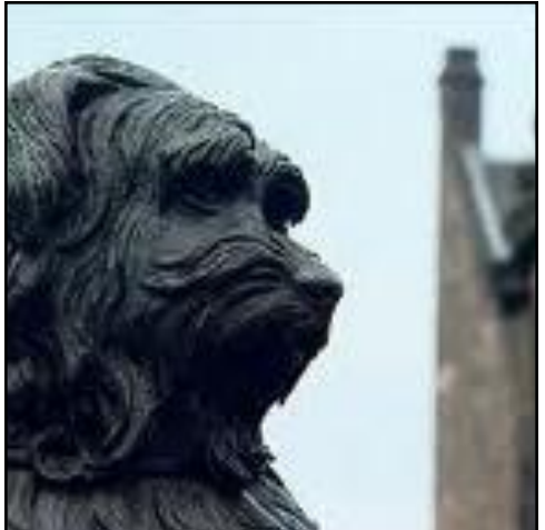
Greyfriars Bobby after the restoration work was recently completed.

On October 1, 2013, a project was undertaken by restoration specialists Powderhall Bronze to clean and wax the affected area to restore the dark color on Greyfriars Bobby's snout to reverse years of wear and tear caused by people rubbing Bobby's snout for luck.