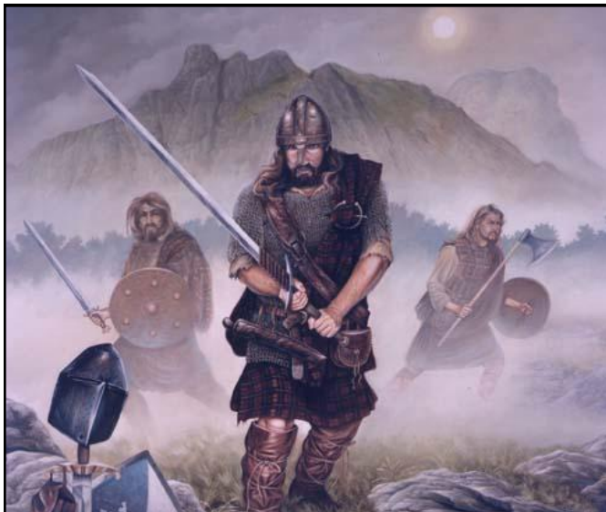
Contemporary illustration of Sir William Wallace