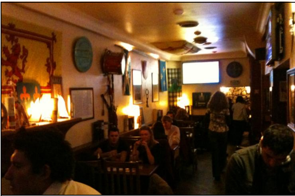
The intimate décor and ambiance of the pub makes it a popular eatery for Scotophiles.

Anticipating what may be the obvious question here, no, we are not planning to look for a French wine bar in Scotland!