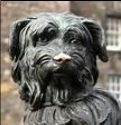
Passersby were unwittingly damaging the statue of Greyfriars Bobby by rubbing his snout for good luck, seen here. The damage to the bronze had been very gradual.