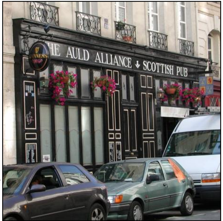
The Auld Alliance Scottish Pub in Paris is an unexpected jewel of Scottish culture and cuisine in the French capital.

Back in Paris following our week-long river cruise to Rouen, which included a visit by motor coach to the Normandy beaches, we walked from the boat to the nearby train station. We purchased our tickets and traveled in the direction of Notre Dame. At the appropriate stop, we exited the train and the station. We crossed the river and a few very busy streets and looked for the Hotel de Ville (their City Hall), then found the street behind it (rue François Miron) that led to the pub. Walking is easy through this part of Paris, given that it is a flat section of the city just a short distance from the river.