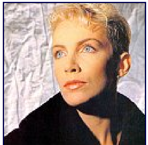
Singer Annie Lennox was also in the running.

Regardless, they were trounced by the numbers who pledged their support (and their vote) to William Wallace.