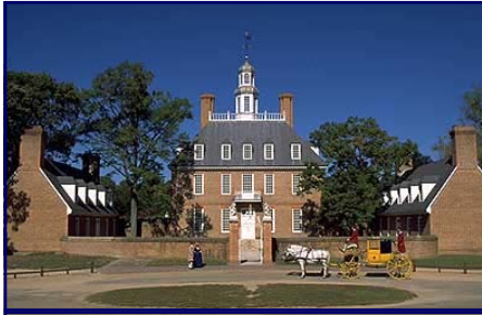
Governor's Palace at Colonial Williamsburg.

Mark off time on your calendars for the next International Gathering of Clan Wallace, planned for September or October 2007. We're going to Colonial Williamsburg!