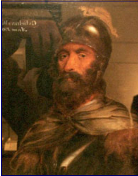
Sir William Wallace was recently voted Greatest-Ever Scot by readers of "Scotland On Sunday." He prevailed over Robert Burns, Flora MacDonald, Robert the Bruce, Sir Sanford Fleming and Adam Smith.

William Wallace was the Scottish patriot whose bloody death culminated in his limbs being sent to the four corners of Britain as a warning to all who followed him. But, just as Edward Longshanks failed to quell the rebellion that led to Scottish independence, William Wallace's legacy lives on. The guerrilla fighter is today named as the Greatest Ever Scot in a popular poll staged by the e-zine "Scotland on Sunday" readers.