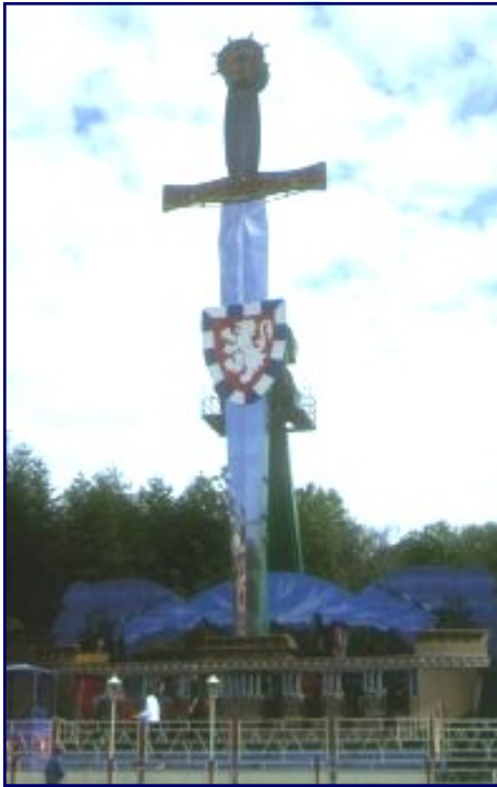
The "other" sword: Wallace's "Loudoun Sword" was last seen in 1972. Today, a replica of the Loudoun Sword towers at the entrance of Loudoun Castle Theme Park.