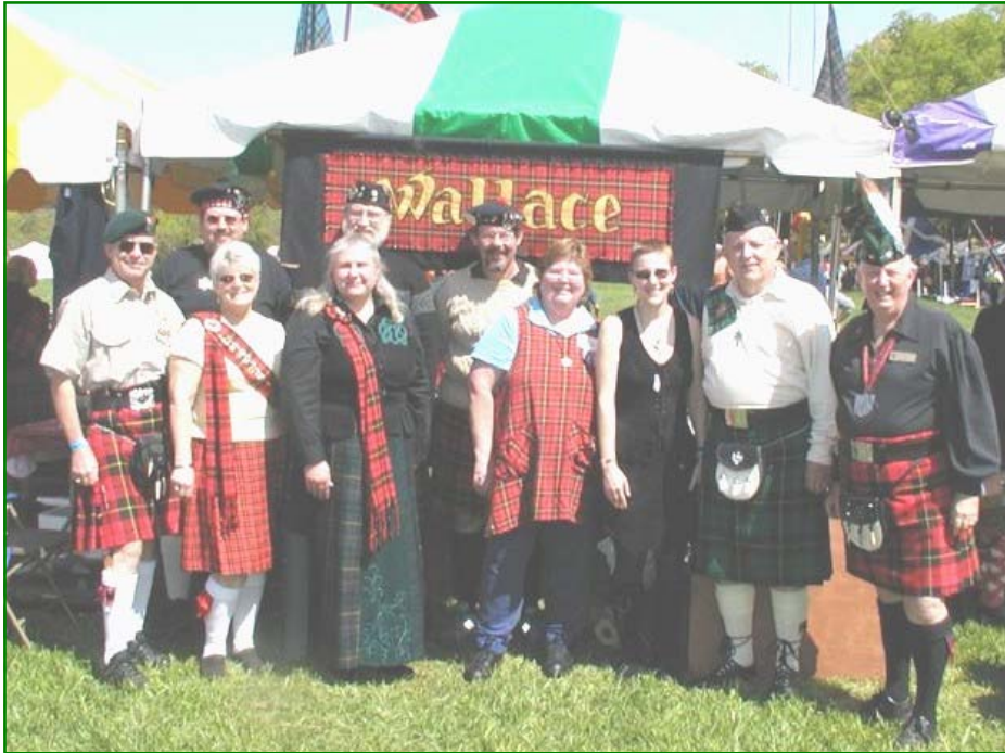
The Clan at the 12th Loch Norman Highland Games at Huntersville, NC: This photo proves that at least ten Wallaces agree that being a Wallace is the best thing in the world!