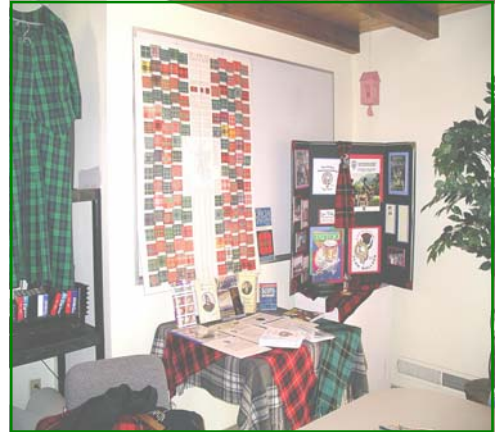
Scottish cultural display built by CWS for PREHAB Arizona cultural diversity education.