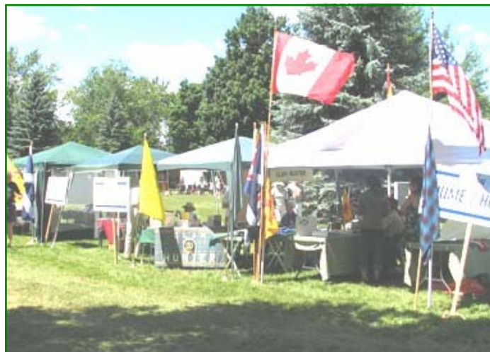
Avenue of the Clans at the New Brunswick Highland Games at Fredericton, NB: Atlantic Canada's premiere Scottish festival & Games.

One of the best and biggest of the East Coast Games and Festivals each year are those held at Loch Norman at Huntersville, North Carolina in mid-April. This event is sponsored by the Catawba Valley Scottish Society, which boasts of about 250 members, conducted this festival and other heritage related projects during the year as part of their mission. This year there were 82 Clans and Societies represented on the field and thousands of