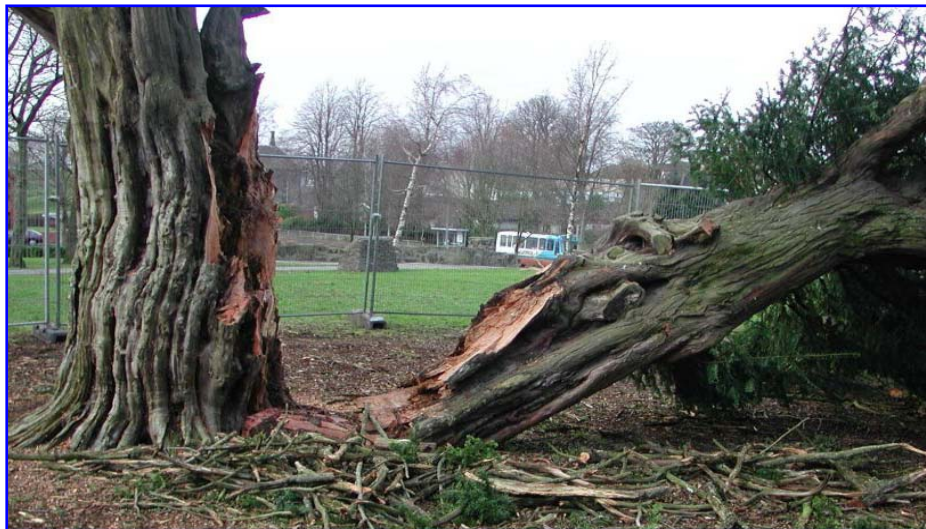
Broken: The Wallace Yew, designated one of Scotland's "Hundred Heritage Trees," lies broken following a severe storm in January 2005. Six new cuttings will eventually replace the old tree.

Renfrewshire Council arranged for the timber to be distributed to a number of craftsmen who produced a range of mementos from the wood, which were put on sale in Paisley Museum and Art Galleries, and in the local Tourist Information Center. A large, very rotten remaining