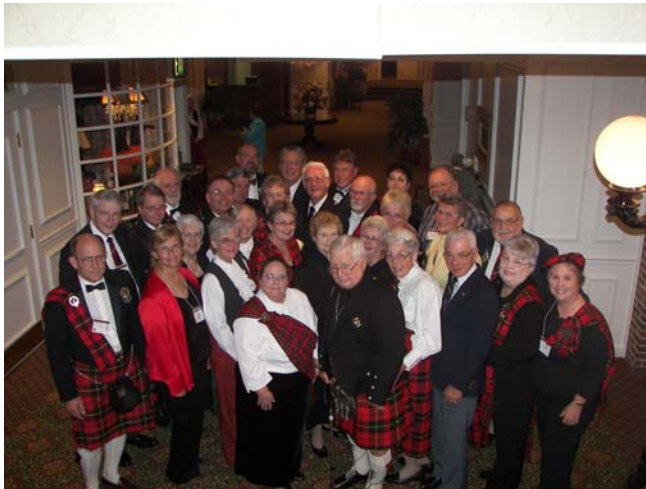
Members East of The Mississippi