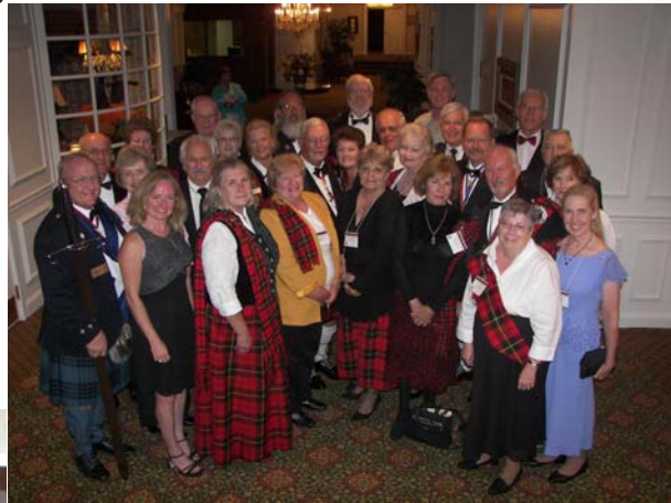
Members West of the Mississippi