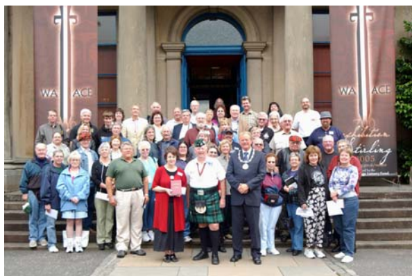
Smith Museum with the Provost (Mayor) of Stirling

The Rosslyn Chapel, St. Andrews Golf Course, The Scottish Parliament Building with the Freedom Papers, Edinburgh Fringe Festival entertainers, Edinburgh Castle and the Military Tattoo were other highlights of the Gathering.