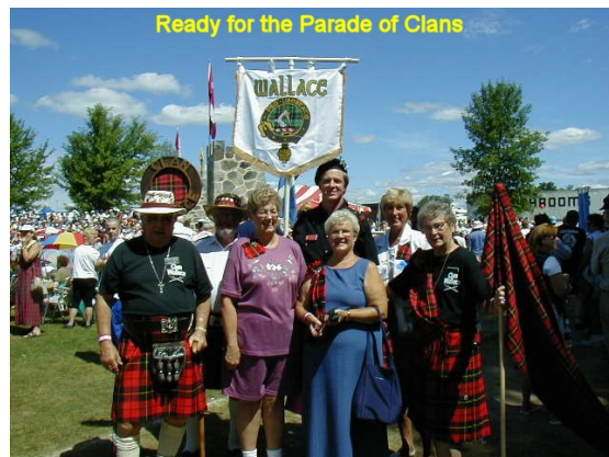
At The Fergus Games